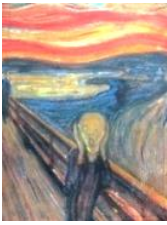
Western Art History The Scream , Munch 19 th century, Norway