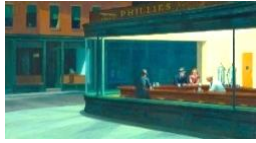
Western Art History Nighthawks , Hopper 20 th century, United States