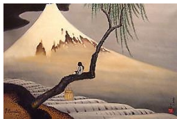
Non-Western Art History Boy Viewing Mount Fuji , Hokusai 19 th century