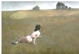
Western Art History Christina's World , Andrew Wyeth 20 th century, United States