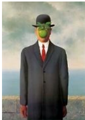
Western Art History The Son of Man , Magritte 20 th century, Belgium