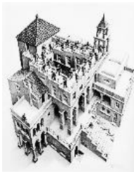
Western Art History Ascending and Descending , Escher 20 th century, Netherlands (Dutch)