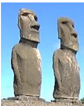
Non-Western Art History Rapa Nui culture Moai c 8 th century