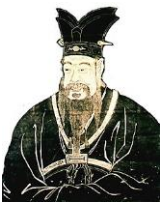
Non-Western Art History Confucius (551-479 BCE), Prince Yun Li 19 th century